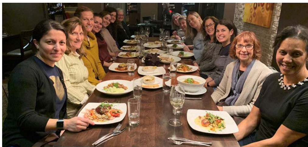
Members of the JCIPE and Pathways to Housing PA teams presented at the 2019 Collaborating Across Borders VII conference in Indianapolis, Indiana.