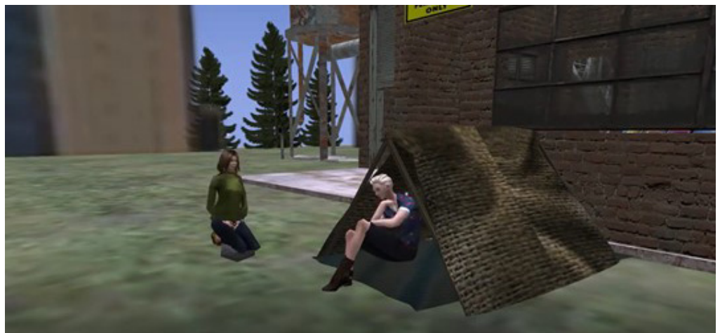
ESHP students from Cohort 5 of Spring 2020 engage in the "Jeff Case" simulation. Here one student has assumed the role of Jeff, who has made their home in a tent in back of an abandoned warehouse. The other student is part of a team from a Housing First organization that does mobile outreach. ESHP provides students the opportunity to simulate an intervention and debrief with each other and a faculty facilitator.

The ESHP project was designed to address just that: equip future health professionals with knowledge, skills, and practice to enhance their work with homeless individuals. ESHP allows interprofessional