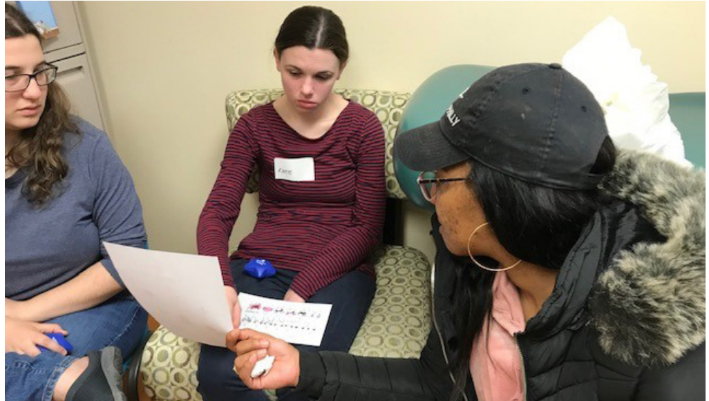
It is all about Perspective; this young lady with autism is providing us with the solutions to communication and conversation.

Jefferson Center for Autism and Neurodiversity has been reaching out across Jefferson University and Jefferson Health to bring individuals with neurodiversity and clinicians and scientists from diverse backgrounds with unique talents together to share ideas, conceptualize, and build a better future. The importance of interdisciplinary and interpersonal collaboration cannot be overemphasized in the development of an accessible community. Key stakeholders drawing from their personal and professional perspectives enhance the outcome by layering experiences with expertise in multiple areas. No single viewpoint can embody the enrichment and learning experience as fully as a united effort can. To this end, we have designed the PEOPLE model: