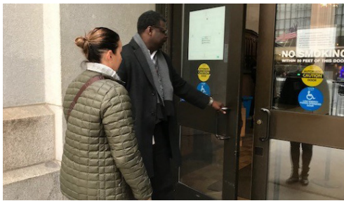
Creating new Processes and Environments that facilitate inclusive access is essential for individuals with autism

ENVIRONMENT: Aspects of the environment that worked and may not have worked are assessed by participants and discussed with designers and architects. Feedback is applied to future experiences to help drive progress for improved participation.