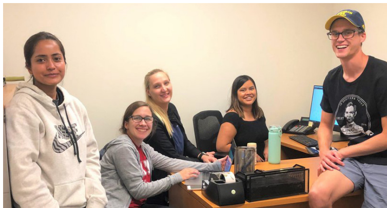
A Hotspotting team meets in Fall 2019 in the JCIPE office to kick off the year and learn more about their patient's story.